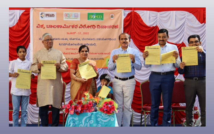
BOSCO Bengaluru observed World Day against Child Labour', in Bengaluru on the theme 'Universal