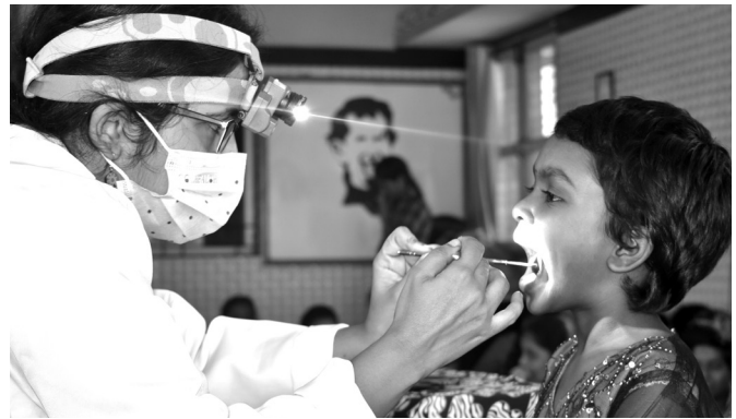
Statistics of Medical Care provided during June 2021-May 2022

health camps including dental camps and eye camps, were conducted during the year. The team assisted 2378 staff and children with regular COVID testing (RTPCR) during the year, and a total of 336 staff and children were administered 2 doses of the COVID-19 vaccine.