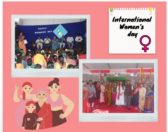
International Women's day