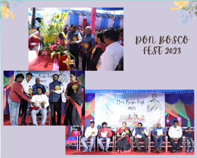
DON BOSCO FEST 2023