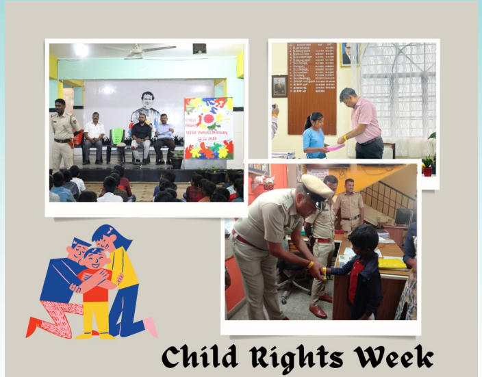
Child Rights Week