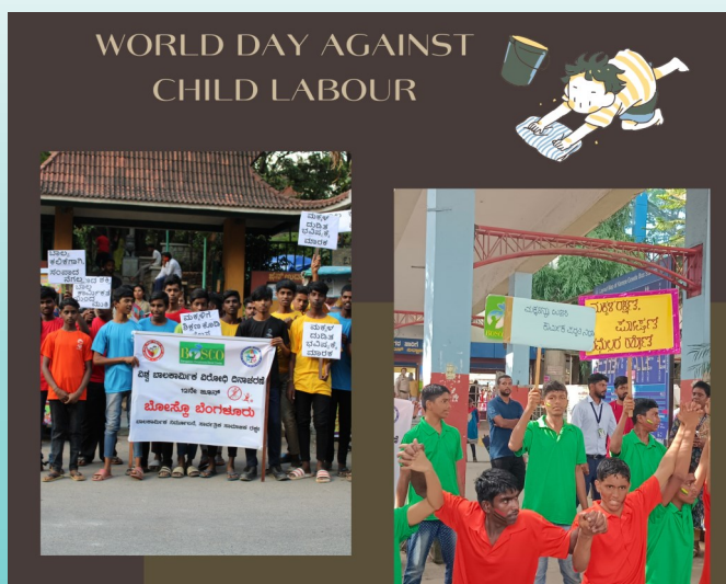
WORLD DAY AGAINST CHILD LABOUR