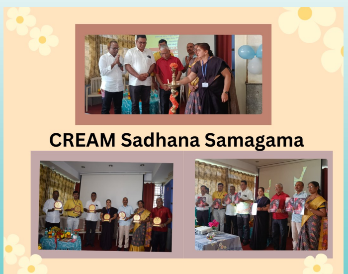
CREAM Sadhana Samagama