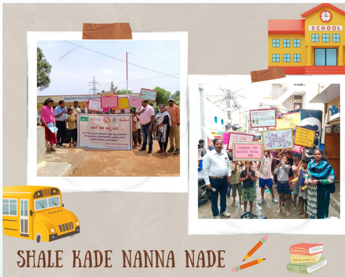
SHALE KADE NANNA NADE